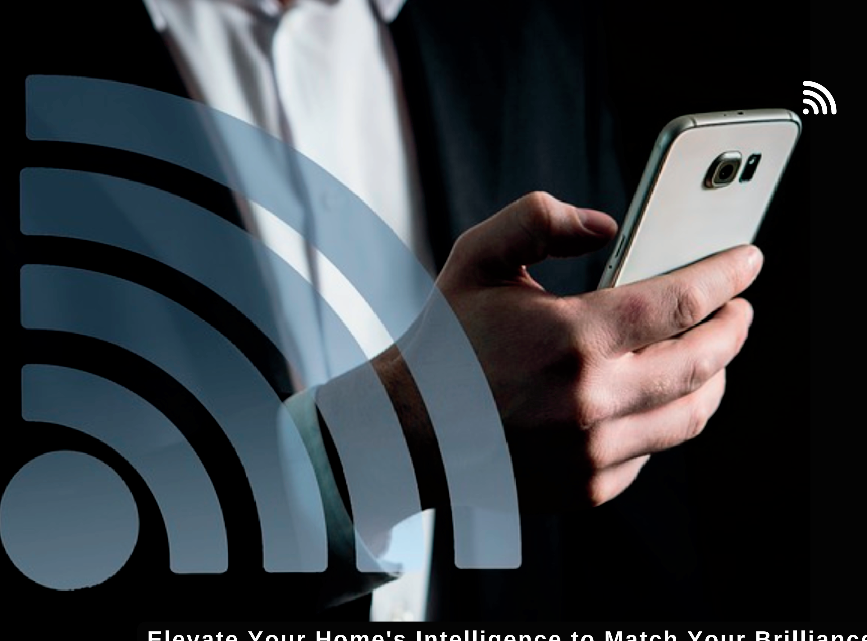
Elevate Your Home's Intelligence to Match Your Brilliance